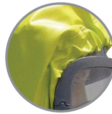
Elasticated hood for a good fit around the SCBA mask visor