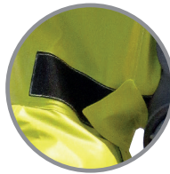
Chin strap with hook-and-loop closure