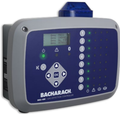
(Pictured with optional strobe configuration)

For Safety Compliance in Refrigeration Applications